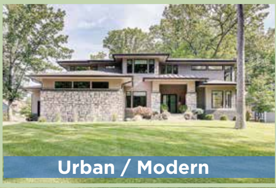
Urban / Modern

Basement: 2,041 SQ FT total 1,553 SQ FT Finished